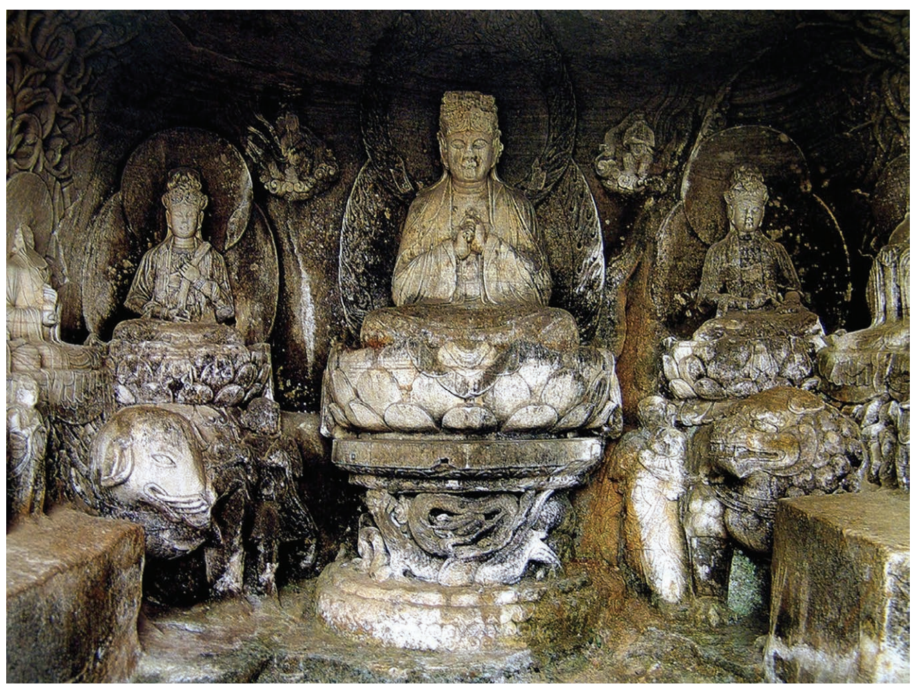
Fig.3. Rocana assembly in cave 3 of the Miaogao shan grottoes, Dazu, Sichuan. Song period (960-1279). Collection of the Sculptures from Chinese Grottoes, vol. 7, Dazu (中國石窟雕塑全集-7-大足), edited by Zhongguo shiku diaosu quanji bianji weiyunhui (中國石窟雕塑全集編輯委員會). (Chongqing: Chongqing chubanshe, 2000, fig. 107).

which time many Buddha figures and triads appeared with a similar iconography, i.e. with a Buddha wearing a crown or performing the special mudra and seated between Manjusri and Samantabhadra seated on their respective animals. For instance, cave 3 of the Miaogao shan grottoes in Dazu county, Sichuan, which dates from the Song period, has a seated Rocana wearing a crown and flanked by Manjusri on a lion and a Samantabhadra on an elephant (Fig. 3). A groom and a Sudhana figure appear beside each bodhisattva, and two apsarasas fly above Rocana. Clearly, some features of the Rocana assembly at Feilaifeng, including the composition and the crown, were also in use in Sichuan by the end of the eleventh century. A few Buddha images outside of Hangzhou include a mudra similar to that of the Rocana at Feilaifeng. For example, the