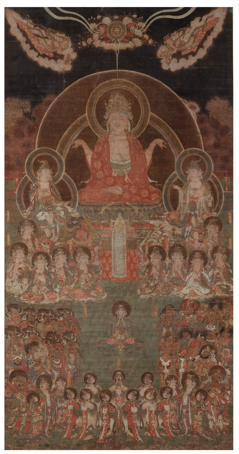
Fig.1. A Transformation Tableaux of the Sutra of Perfect Enlightenment. Late Goryeo Dynasty (918-1392), c. Thirteenth or fourteenth century. Ink and colors on silk, 165.5 x 85.5 cm.